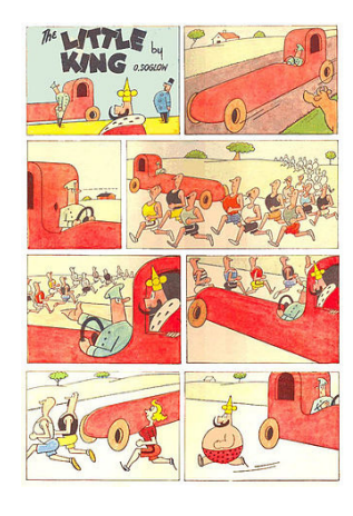
1. Page from The Little King (Otto Soglow)